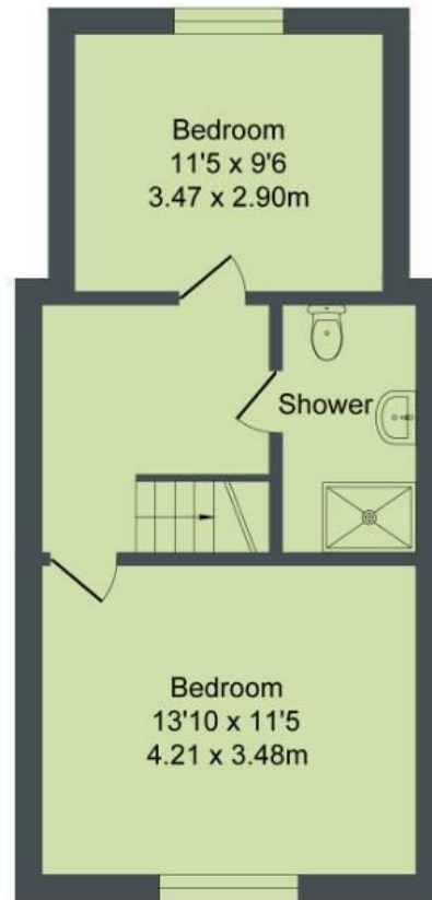
First Floor Approx. Floor Area 405 Sq.Ft (37.6 Sq.M.)